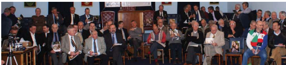
Part of the audience at Mount Edgcumbe Masonic Hall, Plymouth